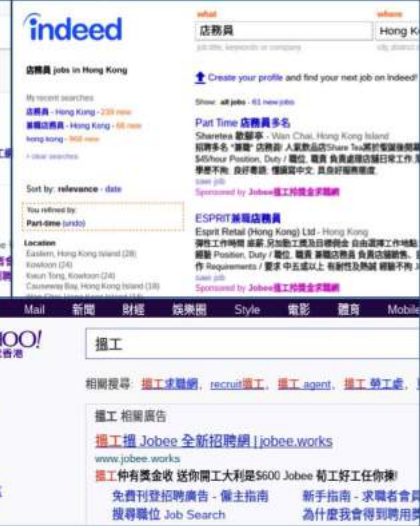
Search Ads on Google, Yahoo, indeed