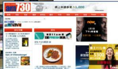
Floating Banner Ads on Various Web Media