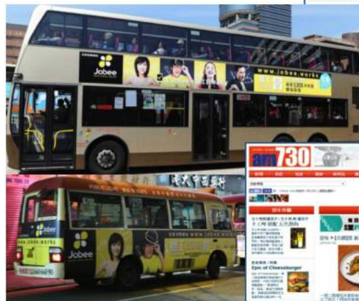
Ad Wrapping Buses